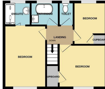
1ST FLOOR 418 sq.ft. (38.6 sq.m.) approx.