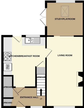
GROUND FLOOR 516 sq.ft. (47.9 sq.m.) approx.